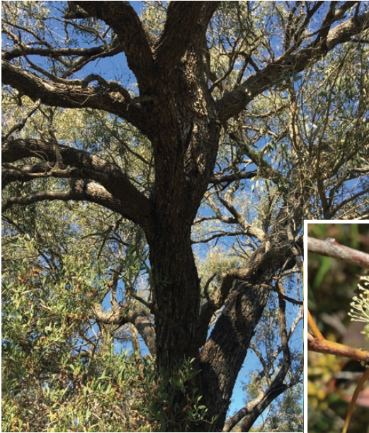
Habit and bark